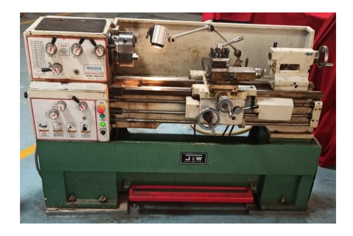
All Geared Lathe – Horizon Make