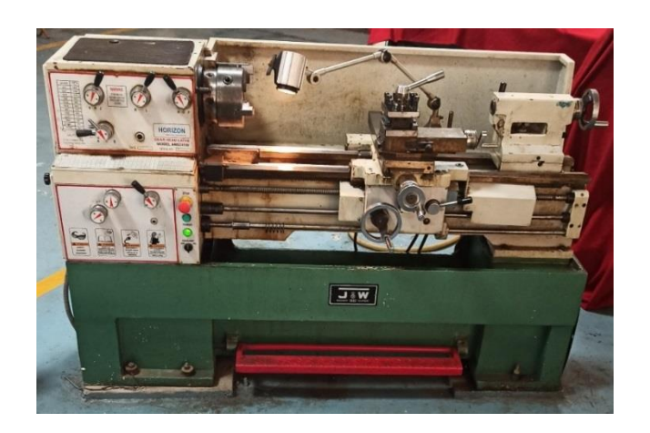
All Geared Lathe – Horizon Make