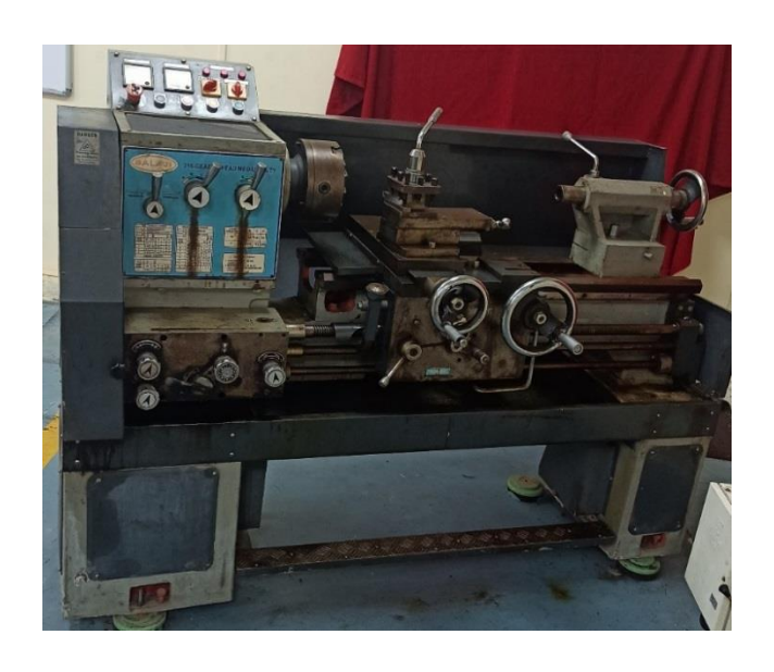
All Geared Lathe – Balaji Make