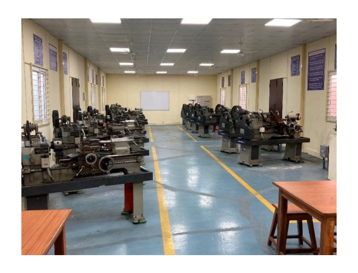
Lathe Shop II