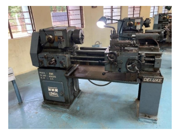
All Geared Lathe - MMM Loyal Make