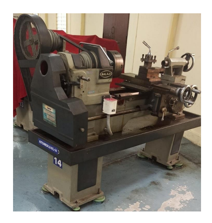
Cone Pulley Head Medium Duty Lathe